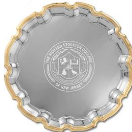
Picture is a close representation of the actual award.

Enter Premier Std/JWW for a chance to win the prestigious Premier Cup! "Don't Be Shy, Punch Cancer! Premier Cup Challenge"